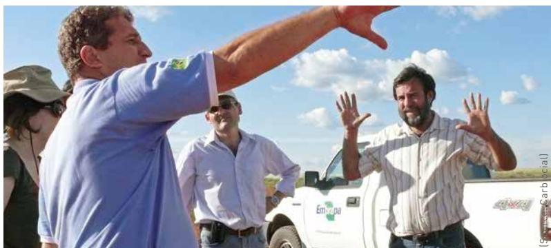
Researchers discussing with local farmers near the city of Sinop (northern Mato Grosso, Brazil, Carbiocial research project).