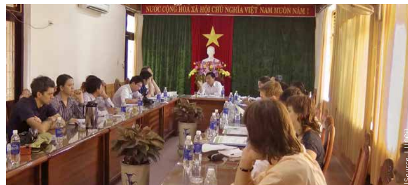
Stakeholder workshop in Vietnam (LUCCi research project).

Their endeavours have already borne fruit. The European Environment Agency for example plans to