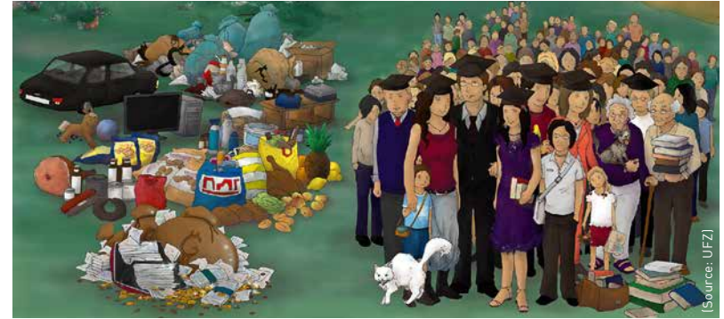
Land use decisions influence environmental quality and quality of life (LandYOUs online game).

to the satisfaction of the population can hope for reelection at the end of their five-year term of office – otherwise the end of their political career looms.