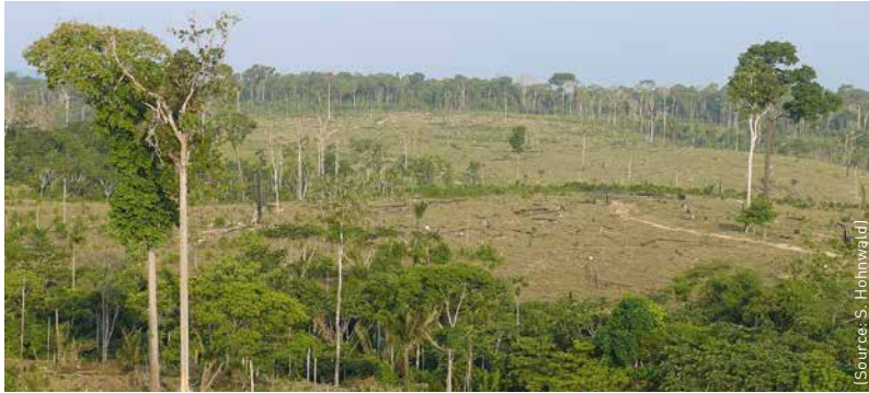
Conversion of rain forests into pastures, Brazil (study area of the Carbiocial research project).